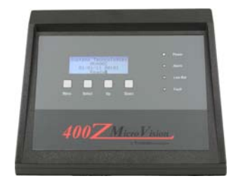
MicroVision 400Z Desktop Console with programmable alpha-numeric display and optional staff pocket paging.